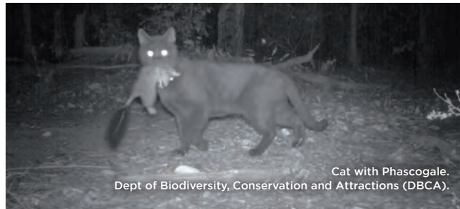
Cat with Phascogale.

Prepared by BirdLife Australia (WA Branch). With thanks to Biosecurity Tasmania and the Department of Primary Industries, Parks, Water and Environment, Tasmania.