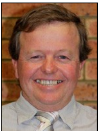
Cr Will Scott

The new Mount Magnet Mining and Pastoral Museum was officially opened by Member for North West, Vincent Catania MLA on 7 April 2011. The Museum Building and adjoining large display shed cost $1.576 Million of which $718,000 came from the Country Local Government Fund, $300,000 from the Mid West Development Commission and $558,000 from the Shire.